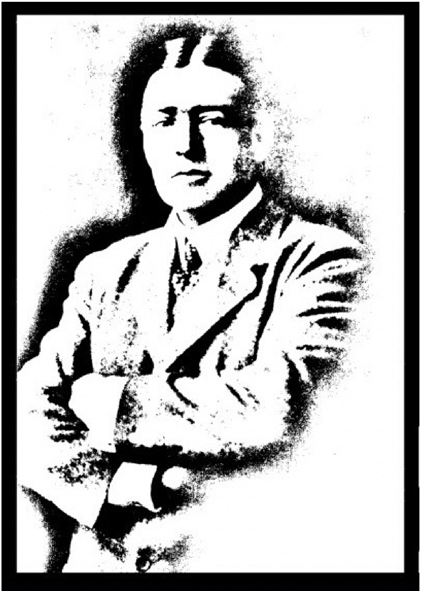
Sir Ernest Shackleton