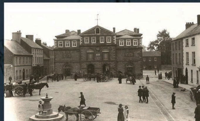
The 300 year old Market House as Shackleton would have known it and home of the museum that now bears his name.

Join us on our journey. Let's make it happen.