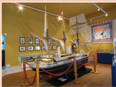
Scale model of the Endurance in Athy Heritage Centre - Museum