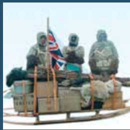
Antarctic Adventurers appearing during the Shackleton Autumn School