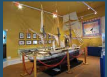
Scale model of the Endurance in Athy Heritage Centre - Museum