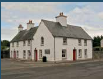
Mary Leadbeater's House in Ballitore part of the Field trip on Monday.